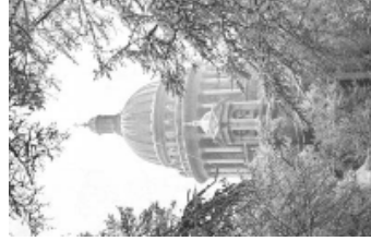
St. Petersburg in photos

In June St. Petersburg has a nice warm weather and the famous white nights can be experienced. St. Petersburg is called "Venice of the North", and in fact it is "cultural capital" of Russia. The magnificent Hermitage and Russian Museum can give a flavour of the cultural image of the city, where you can find numerous theatres and the famous Russian ballet. For someone more inclined towards nature, the Russian czars residences, for example Pavlovsk, Peterhof, and Pushkin, can offer a pleasant hostage; or alternatively one can take an unforgettable boat trip through river Neva and the city channels.